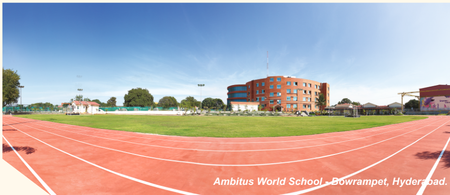
Ambitus World School – Bowrampet, Hyderabad.