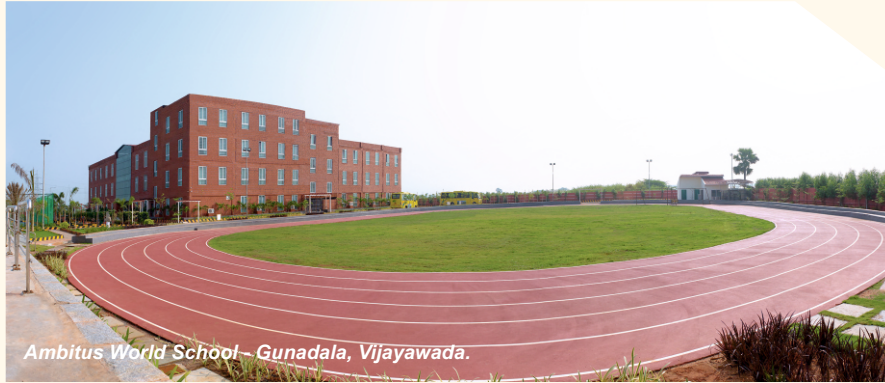
Ambitus World School – Gunadala, Vijayawada.