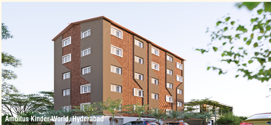
Ambitus Kinder World, Hyderabad