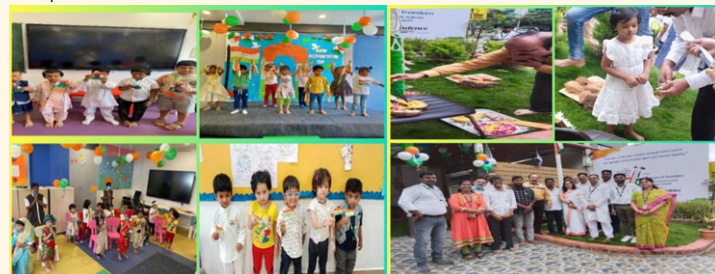
Flag Hoisting at AKW celebrating 75 years of freedom.

Celebrating this day contains the greatest importance in the life of the children in India, keeping this in mind young learners were taught about national symbols and enlightened about the great freedom fighters and their sacrifice for our country. Young Ambitarians were not only exhilarated in actively participating in the weeklong celebration but also played a part in the flag hoisting to honor the historical event of India's Independence.