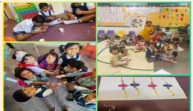
Dosthi nibhana mere dost

To have a good friend is the most beautiful gift one can have in their life, to cherish this feeling of friendship the young buds made hand- crafted friendship bands for their friends. They enjoyed the day with games and play-time to celebrate this amazing bond. Teachers showed them how to make friends and spend joyful moments with them, young ones saw a beautiful short film on bonding and kind gestures that one should show towards their friends and peers. Educators shared their bonding and stories of their friendship with their colleagues to inspire the Ambitans.