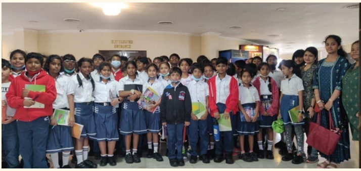
Field trip to Birla Planetarium Grades 5 and 6